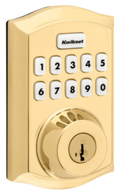
Polished Brass 3