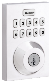
Polished Chrome 26