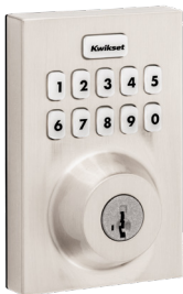
Satin Nickel 15