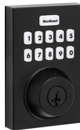
Matte Black 514