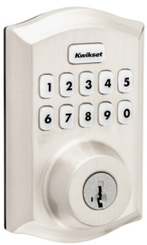
Satin Nickel 15