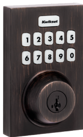
Venetian Bronze 11P