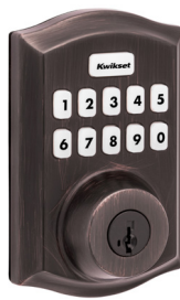
Venetian Bronze 11P